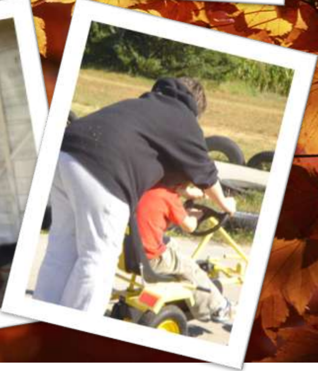
Poppy's Pumpkin Patch 2010